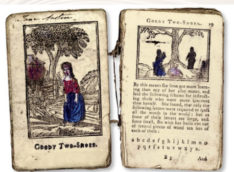
"The History of Little Goody Two-Shoes" by John Newberry

Comenius (1592-1670) was a visionary educator with a passion for making learning accessible to everyone.