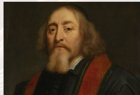
John Amos Comenius