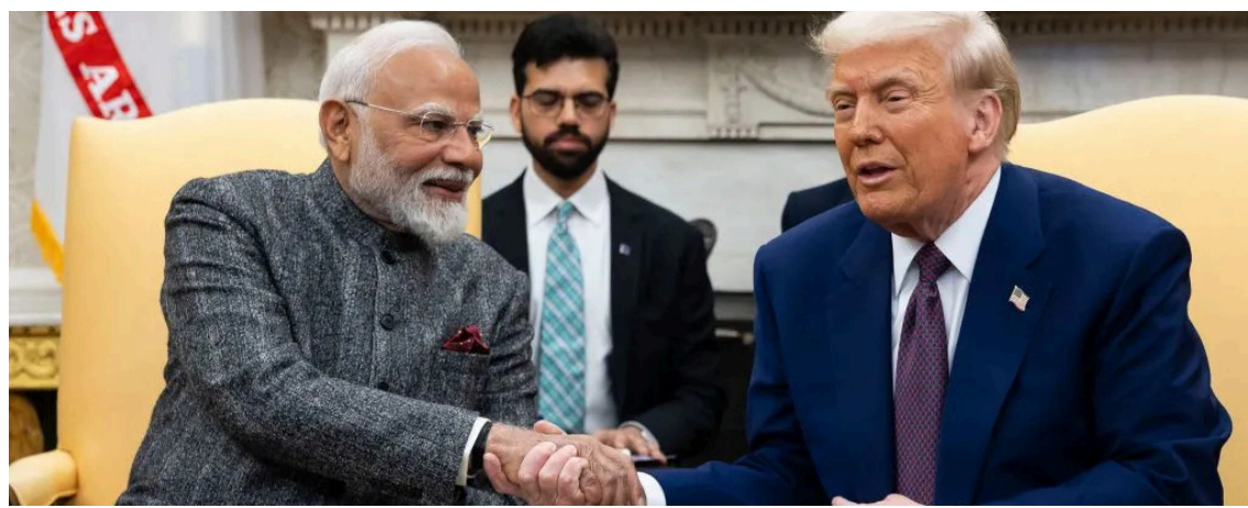
President Donald Trump and India's Prime Minister Narendra Modi shake hands

Vivek Ramaswamy, a Republican, was also met by PM Modi. Prior to his meeting with Prime Minister Modi, US President Donald Trump declared reciprocal tariffs, naming India as one of the highest-charging nations