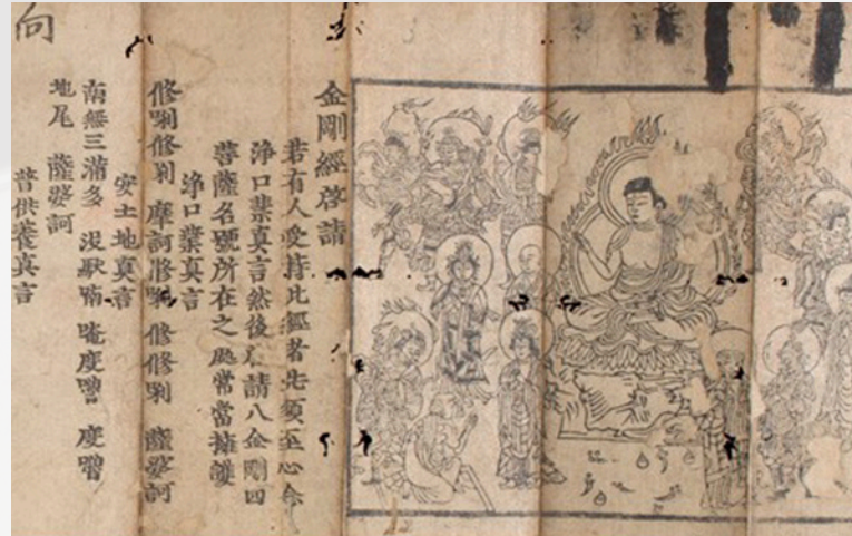
The Diamond Sutra

Humanistic Buddhism, its teachings center around four core principles: to give generously without attachment, to free all beings without a sense of